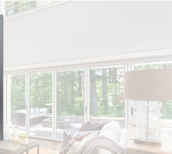
Dimensions: L256mm x W275mm x D49mm

The DB-D21DKH combines ease of use & convenience with both audio & video push notifications directly to your smartphone. The station includes an integrated access keypad & call button. Suitable for outdoors this unit is ideal for apartment complexes