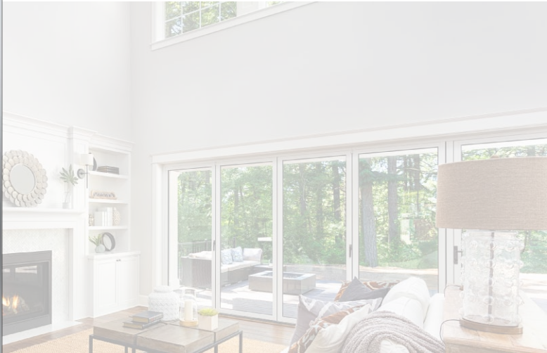
Dimensions: L402mm x W156mm x D49mm

The DB-D21DKV combines ease of use & convenience with both audio & video push notifications directly to your smartphone. The station includes an integrated access keypad & call button. Suitable for outdoors this unit is ideal for apartment complexes